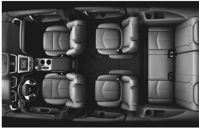
This overhead view of the 2013 Acadia's cabin shows all three rows of armrests, along with the cupholders and storage integrated within them..

"Once a layout is in place after having been evaluated and optimized over a hundred hours in a