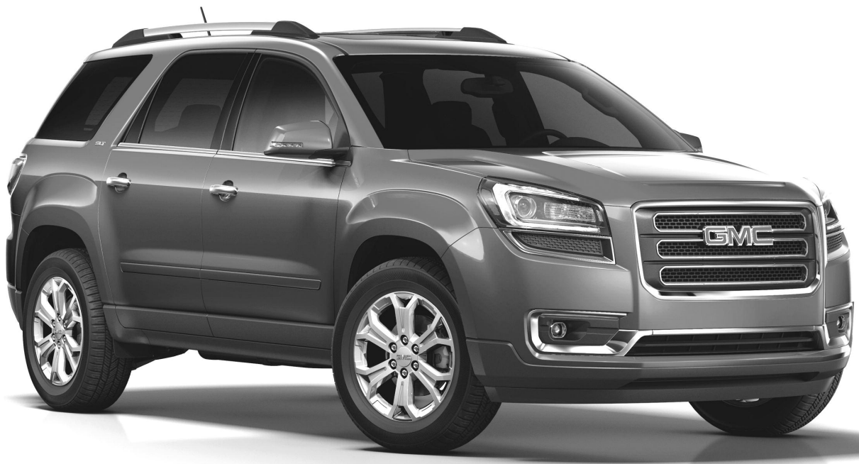
The 2013 GMC Acadia SLT crossover SUV.