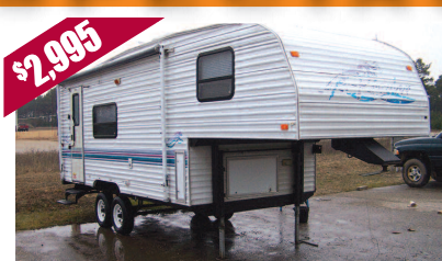
1998 PROWLER 25' FIFTH WHEEL. Sale Priced - $2,995