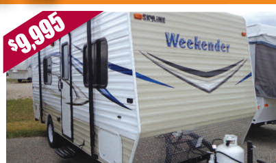
NEW 2013 WEEKENDER 18' TRAVEL TRAILER. Sale Priced - $9,995