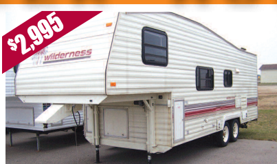
1992 WILDERNESS 255K 25' FIFTH WHEEL. Sale Priced - $2,995

INTERNATIONAL RV WORLD JUST WEST OF I-75 EXIT 282•GAYLORD