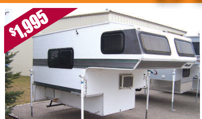
1985 REAL LITE 8' TRUCK CAMPER No leaks, all appliances working, plus a toilet! $1,995